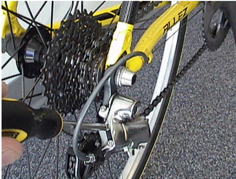
Figure 2: Adjusting the high range adjuster screw

Having one or more gears blocked out will have one side effect. Although the derailleur will not allow the chain to engage the blocked out gears, the shifter will still “click” to those gears. As this is done, the cable will appear to have extra slack in it. This is normal and the cable should not be adjusted to remove the slack from the cable. For at least Shimano shifters, the amount of cable taken out by each shifting click is not the same for all gears and hence, if the cable is adjusted, the indexing of the derailleur will be wrong resulting in imprecise shifting.